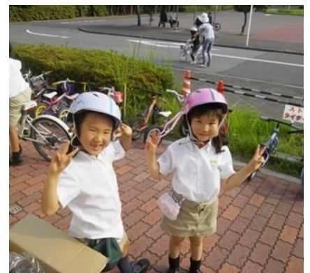
Hanamigawa Ryokuchi Traffic Park

With two new schools opening nearby, we believe raising awareness of road safety will help prevent accidents. Hanamigawa Ryokuchi Traffic Park ( https://www.chibacity-ta.or.jp/en/spots/hanamigawaryokuchikoutsuukouen ) is one of the places where we can learn road safety.