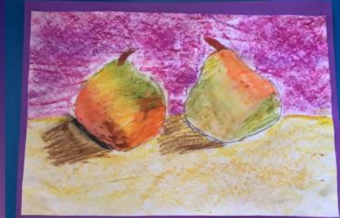
My ART work 😊