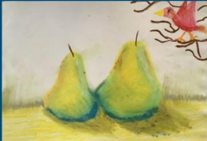
Still Life Drawing- A Pair of Pears

As part of their work in Art, the students in Grade 4 have been learning about still life drawing. They have practiced shading, perspective, light and shadows. We hope that you agree that the results are some fantastic artwork. Beautiful work, G4!